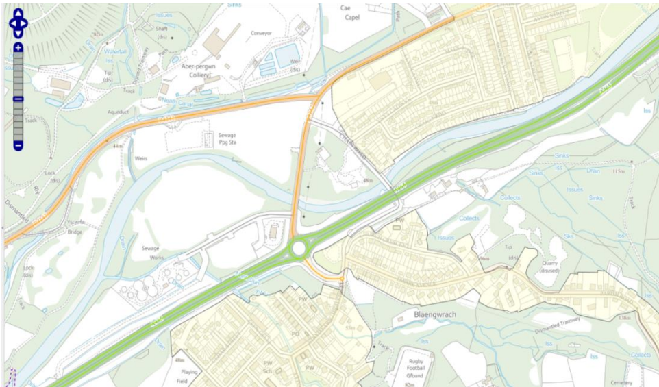
Figure 1: Residential settlement Boundary (Policy SC1 refers)

The site is located on the western edge of Glynneath, positioned between Chain Road to the east and the B4242 to the west. For the purposes of the adopted Local Development Plan the application site is located outside the defined settlement limits (as identified on figure 1 below).